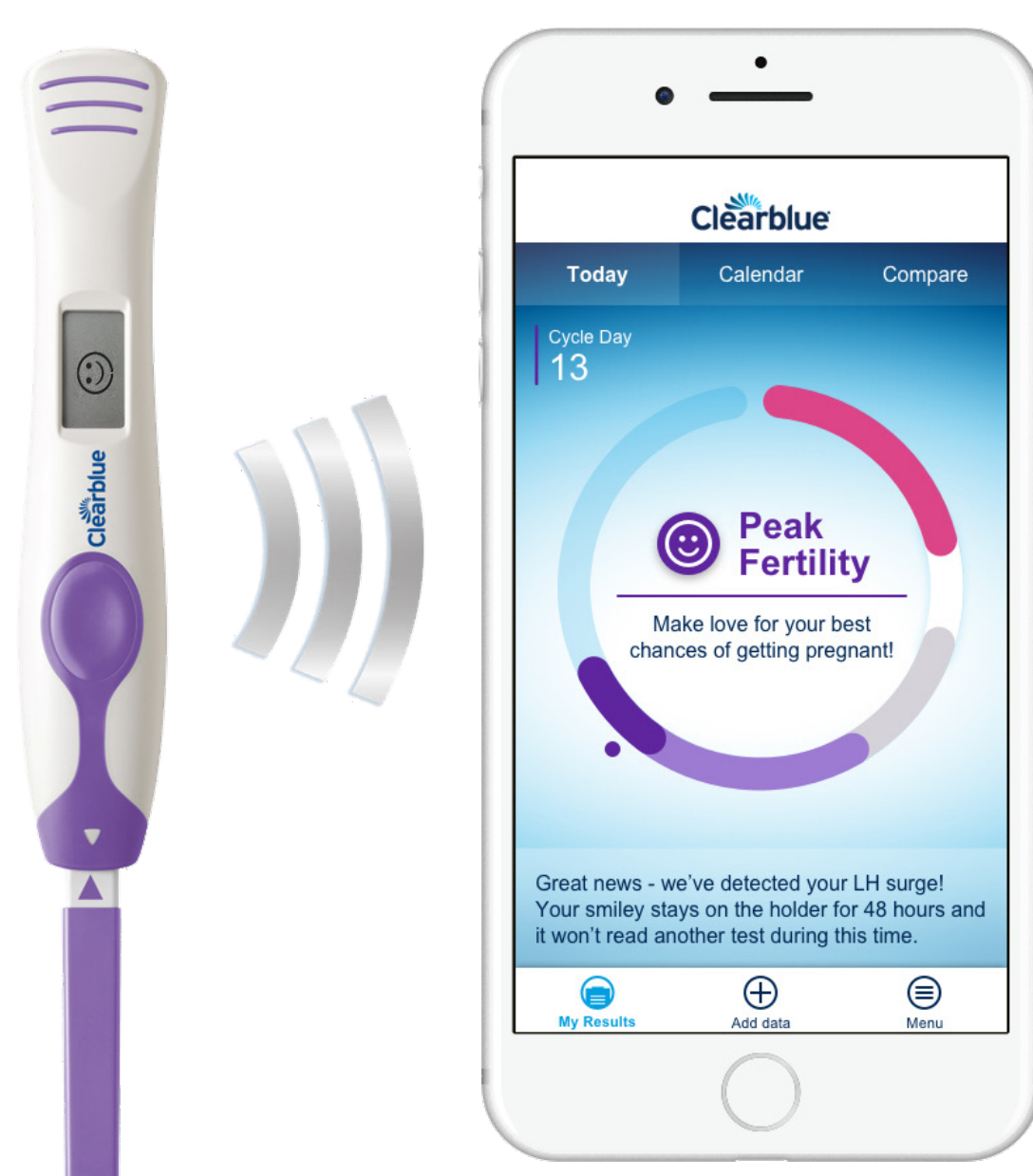
Figure 1: Clearblue Connected Ovulation Test System enables monitoring of hormone levels to identify the fertile period. This test determines three phases of fertility: Low (LH and estrogen metabolite E3G at baseline), High (E3G rise from baseline), and Peak (LH surge detected). Bluetooth® connectivity enables test results to be synced to an app. Users can add intercourse, menses and cycle data to the app, and the app also indicates testing days.